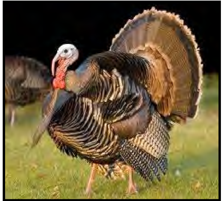
Male Wild Turkey

There are 6 different subspecies of wild turkey in North America, showing differences in coloration, habitat, and behavior. In our region, the Rio Grande Wild Turkey ( M. g. intermedia ) is dominant, naturally ranging through Texas to Oklahoma, Kansas, New Mexico, Colorado, and Oregon. Having slightly longer legs than other subspecies, it is better adapted to a prairie habitat, with a more greenish-coppery sheen and buff-colored feathers on the tail tips and lower back. This subspecies prefers brushy areas near streams or rivers, and forests of scrub oak, pine, and mesquite.