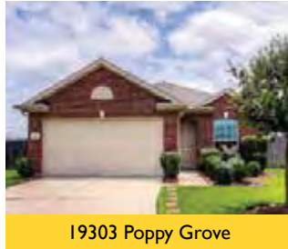
19303 Poppy Grove