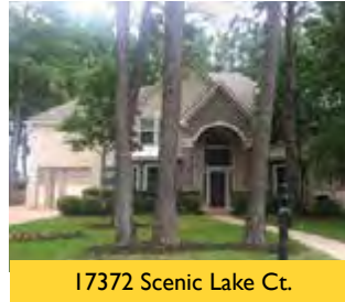
17372 Scenic Lake Ct.