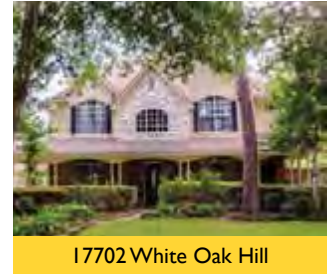
17702 White Oak Hill