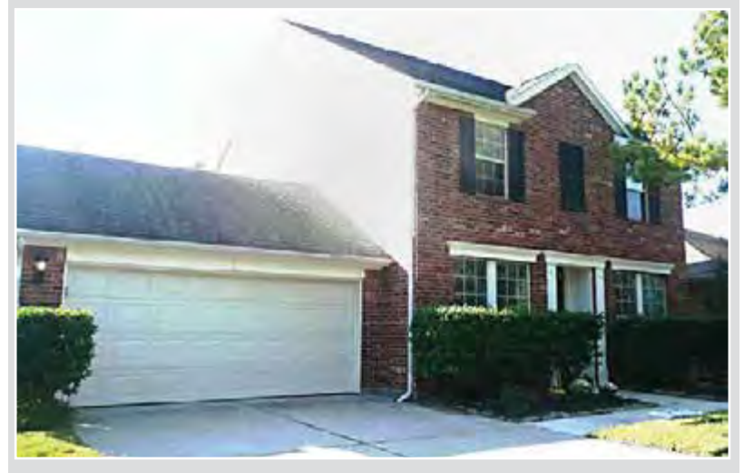
16711 Sonoma Del Norte

Do you know anyone looking for a new home? Pick your neighbor.