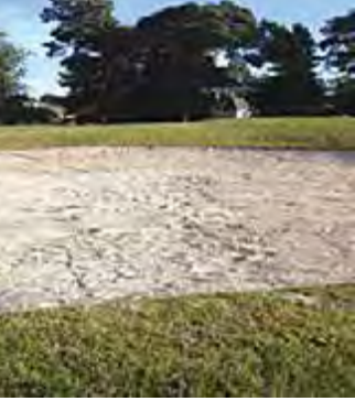
2-3 inches of new sand added to the bunker faces

2 The Clippings - December 2014 Copyright © 2014 Peel, Inc.