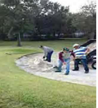
Adding the sand