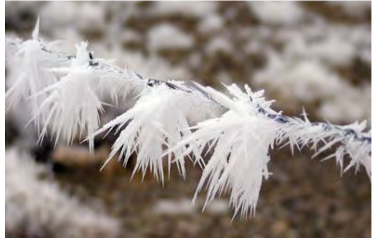
Hoar frost on barbed wire

The most significant factor that determines the basic shape of the ice crystal is the temperature at which it forms, and to a lesser degree humidity. The intricate shape of a single arm of a snowflake is determined by these atmospheric conditions as the entire crystal falls. As slight changes in