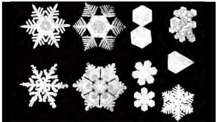
Snow crystal forms

temperature and humidity occur minutes or even seconds later, a crystal that begin to grow in one way might then change and branch off in a new direction. Since all six arms of a snowflake experience the same changes in atmospheric conditions, they all grow identically. And since individual snowflakes encounter slightly different atmospheric conditions as they take different paths to the ground, they all tend to look unique, resembling everything from simple prisms and needles to intricately faceted plates and stellar dendrites.