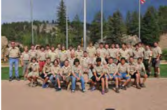
BSA Troop 533