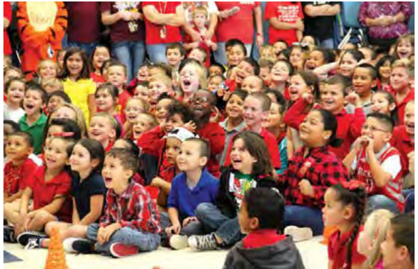
Alvin ISD students excited to learn and simply enjoy school.

According to Templeton Demographics, "The District will continue to need additional facilities to accommodate the continued influx of students. It is expected that within five years Alvin ISD will welcome more than 5,000 additional students which will increase total enrollment from the current 20,914, to nearly 26,000."