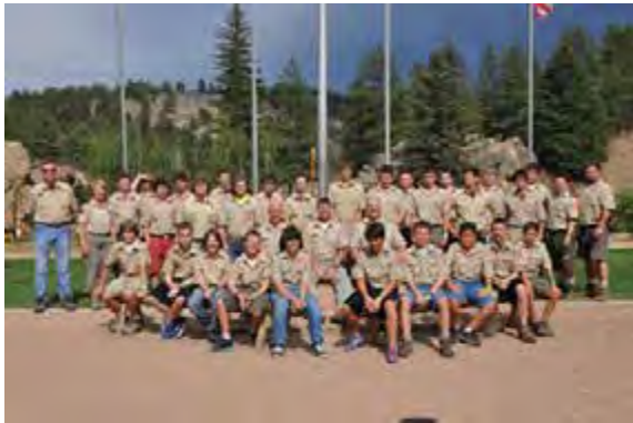
BSA Troop 533