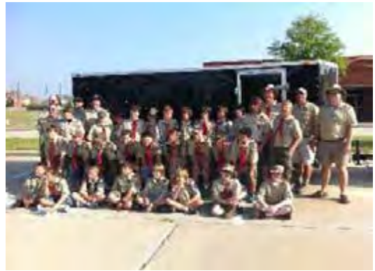
BSA Troop 1907