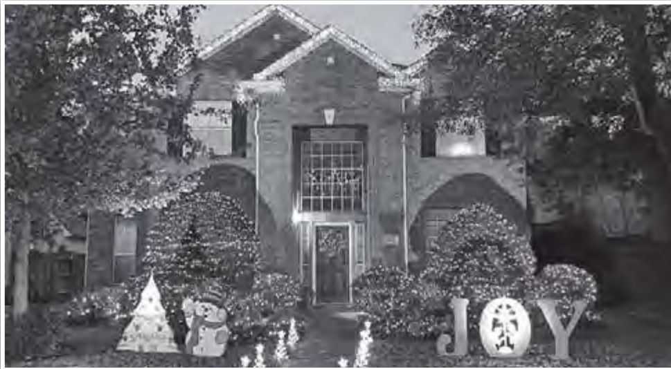
9207 Brahms Lane

We congratulate the following December Yard of the Month winners: