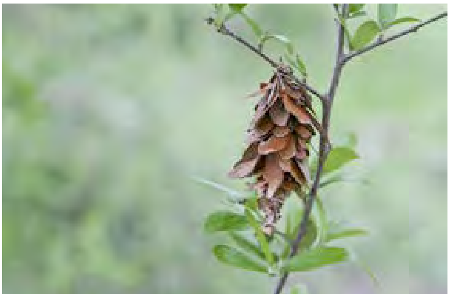
Bagworm in Yaupon