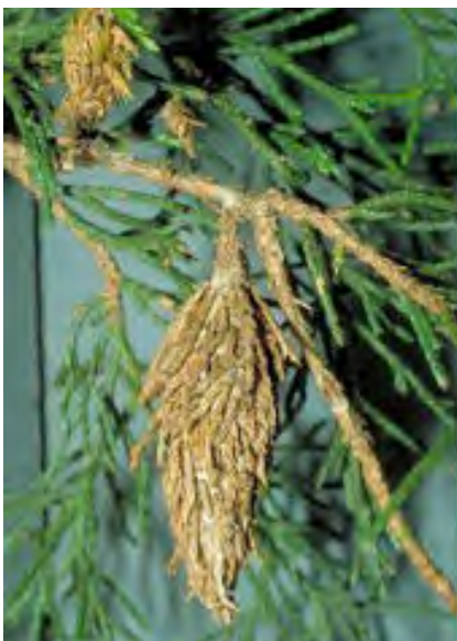
Bagworm in Juniper

Send your nature-related questions to naturewatch@austin.rr.com and we'll do our best to answer them. Check out our blog at naturewatchaustin.blogspot.com if you enjoy reading these articles!