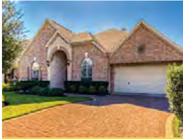
17903 Camp Cove

Sydney Harbor 1 story, 4 bedroom, water front