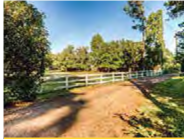
15821 Telge Road

Sydney Harbor 1 story, 4 bedroom, water front