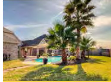
20107 Stanton Lake Dr.

Secluded 13+ acres, 1.5 Story, Pool backs to riding trails, bring the horses, CFISD