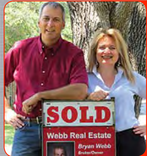
The Broker You Can Trust

! HOW TO SELL YOUR HOME VIDEO ! Watch at www.bryanwebbtx.com/swa