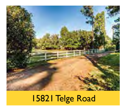
Secluded 13+ acres, 1.5 Story, Pool backs to riding trails, bring the horses, CFISD