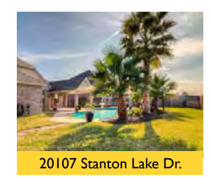
Manned Gate; Resort-Style Backyard 2-story, 4-bdrm w/gameroom & study