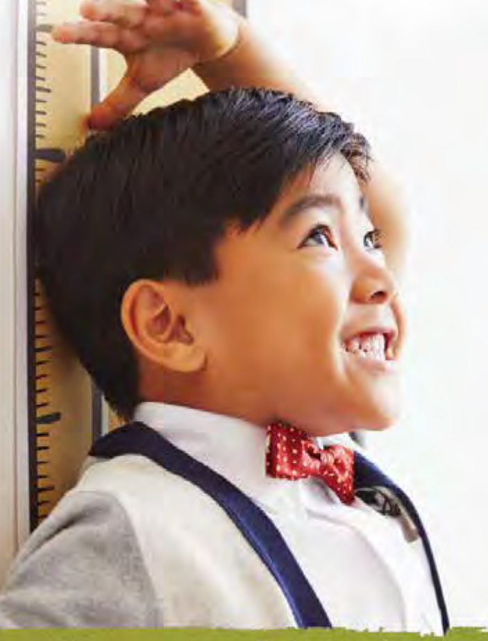
The Leader in Educational Child Care* Infants - Private Kindergarten & After School

Social and emotional intelligence may be the most important determinant of a child's future success.