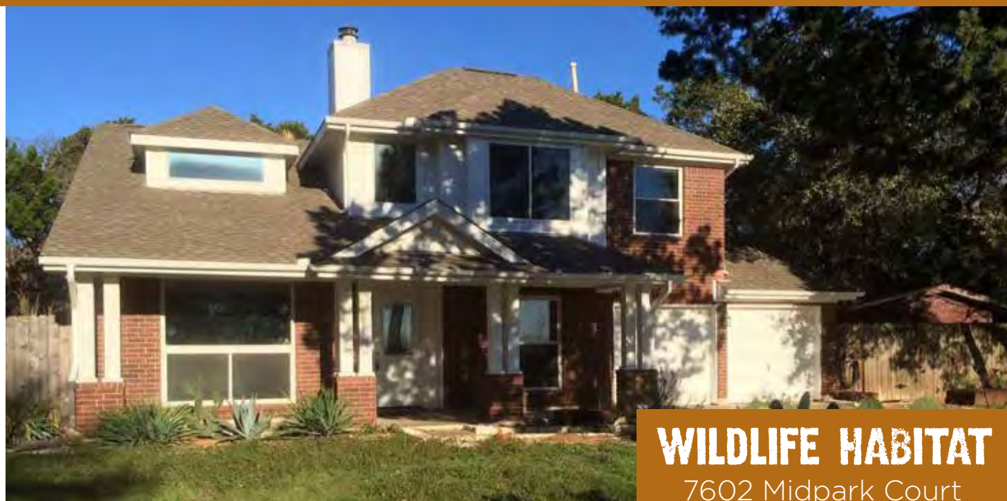
WILDLIFE HABITAT 7602 Midpark Court