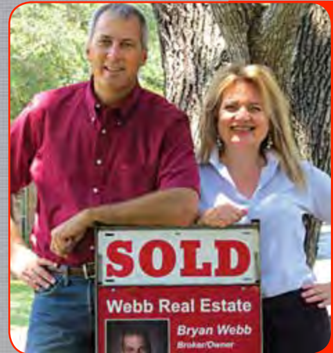
The Broker You Can Trust

! HOW TO SELL YOUR HOME VIDEO ! Watch at www.bryanwebbtx.com/swa