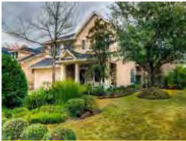
13706 Crested Iris