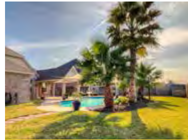
20107 Stanton Lake Dr.

Secluded 13+ acres, 1.5 Story, Pool backs to riding trails, bring the horses, CFISD