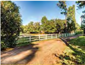
15821 Telge Road

Secluded 13+ acres, 1.5 Story, Pool backs to riding trails, bring the horses, CFISD