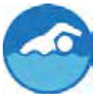
LEARN TO SWIM