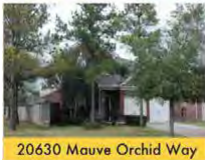
20630 Mauve Orchid Way

Coles Crossing Beauty w/ Pool - $425,000