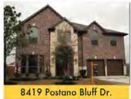
8419 Postano Bluff Dr.