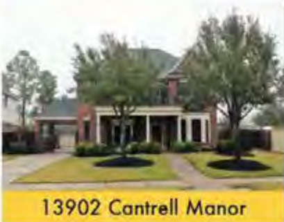
13902 Cantrell Manor

Coles Crossing Beauty w/ Pool - $425,000