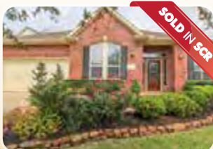
2502 HARBOR CHASE DRIVE