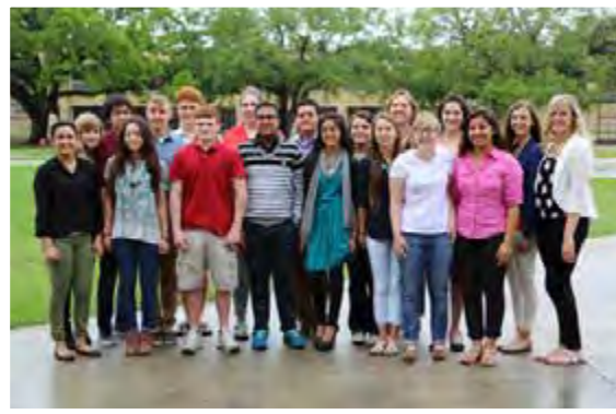
Picture are the top 20 students of the Alvin HS Class of 2015

ASSETS Academy top two students (Continued on Page 7)