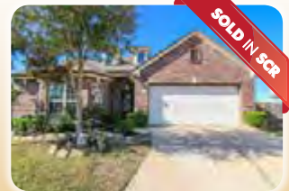
2710 BARONS COVE CT

My listings sold after an average of only 12 days on the market last year! Call me today! I have a SOLD sign ready for YOUR front yard!