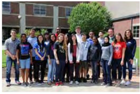
Pictured are the Manvel HS Top 20 student of the Class of 2015

The Alvin ISD Education Foundation will honor the above listed students at the annual Celebration of Academic Excellence, which is set for Tuesday, May 19 at Victory Camp in Alvin, located across from Living Stones Church. Sponsorships are still being accepted for the event. For details contact the Education Foundation at 281-245-2505.