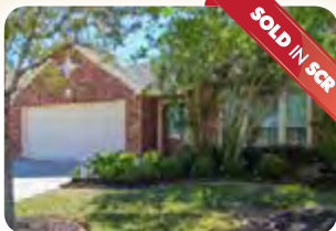
2003 SHORE BREEZE DRIVE