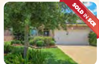
2009 CREEK RUN DRIVE