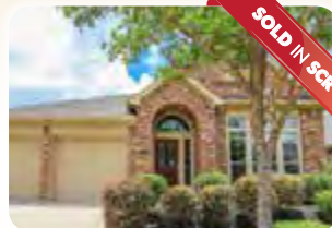
2005 SHORE BREEZE DRIVE