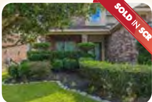
2003 ROARING SPRINGS

TWO WORDS DESCRIBE REAL ESTATE IN YOUR AREA ... SELLER'S MARKET!