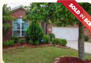
13102 FERRY COVE