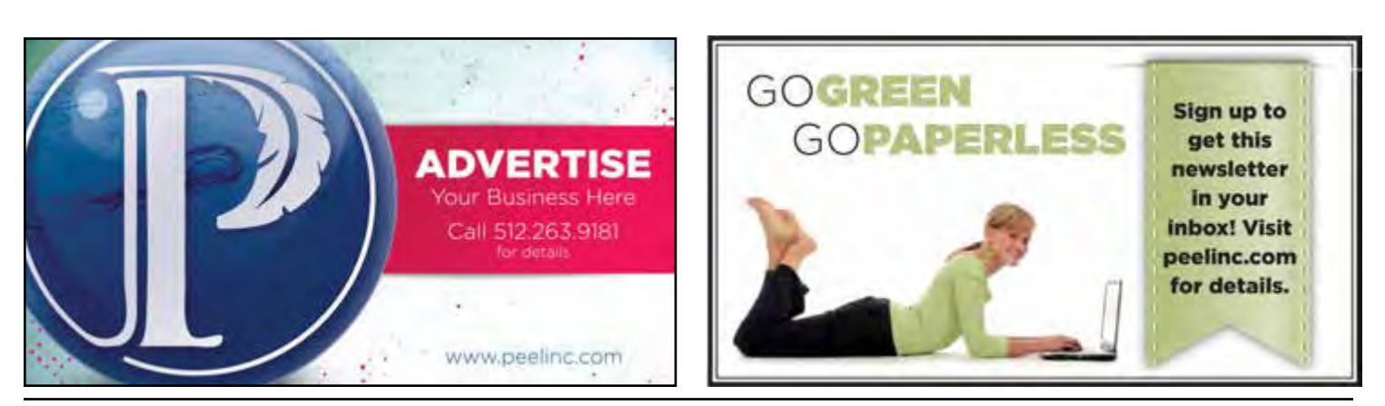
8 Spectator - June 2015

Founded in 1949, ABWA provides business training and networking opportunities for women of diverse occupations and backgrounds. ABWA has dedicated 60 years to women's education, workplace skills and career development training. For more information, visit, www.abwa.org.