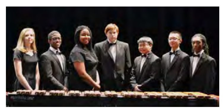
(Continued on Page 5)

The students rehearsed their music for two months; then recorded and submitted selections for consideration by The Midwest Clinic at the beginning of March. Selected groups were notified in April.