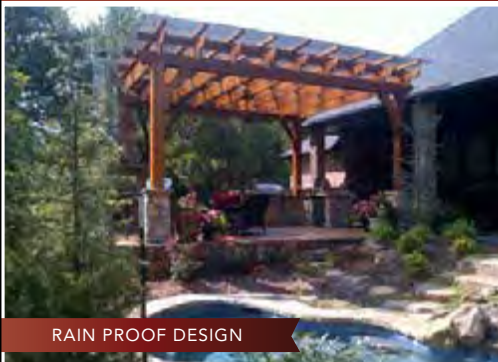
RAIN PROOF DESIGN

PATIO COVERS | PERGOLAS | CAR PORTS | PORTE COCHÈRES | DECORATIVE OUTDOOR FLOORING