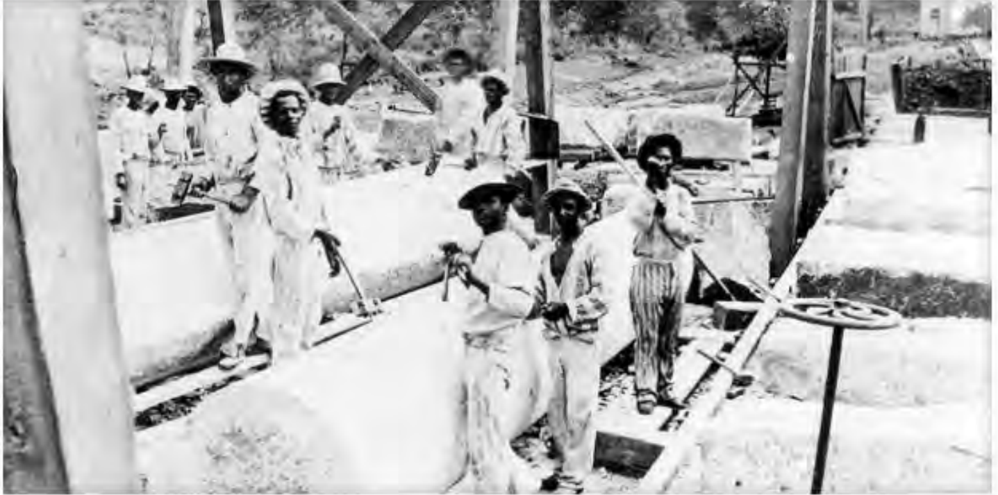
Ten flatcar loads of limestone a day were quarried by convicts and shipped to the Capitol in 1885 from (what is now called) Convict Hill in Oak Hill, then known as Oatmanville.