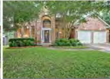
CIRCLE C $449,900 5 BR 4 BA