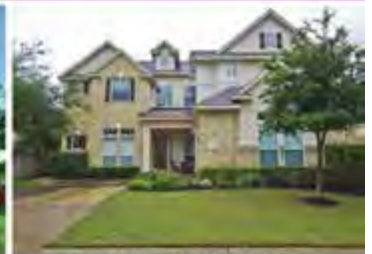
MERIDIAN $500,000 4 BR 3.5 BA