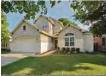
CIRCLE C $439,500 4 BR 2.5 BA