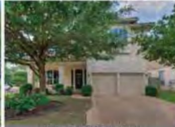
CIRCLE C $409,900 4 BR 3 BA