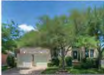
CIRCLE C $392,000 4 BR 2.5 BA