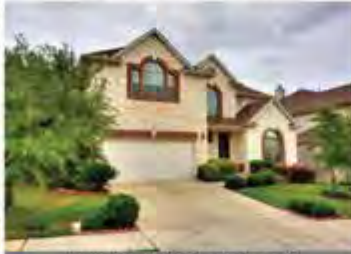
MERIDIAN $439,000 4 BR 3 BA