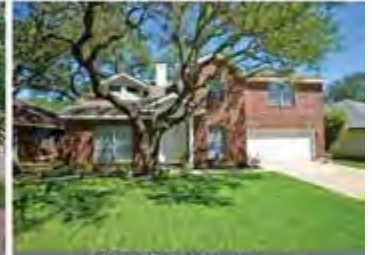
CIRCLE C $349,900 4 BR 2.5 BA

SEE WHAT YOUR HOME IS WORTH IN TODAY'S MARKET! VISIT ASHLEYHOMEVALUATION.COM