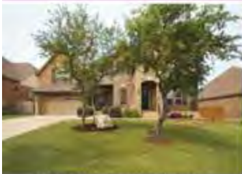
MERIDIAN $699,000 4 BR 3.5 BA