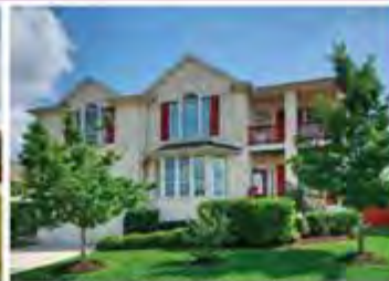
LANTANIA $599,000 5 BR 3.5 BA