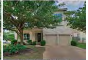
CIRCLE C $419,000 4 BR 2.5 BA