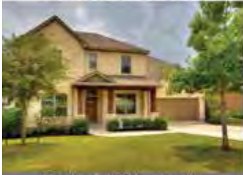
BELTERRA $410,000 4 BR 3.5 BA