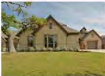
BELTERRA $561,600 4 BR 3.5 BA