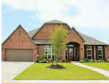
Cypress Creek Lakes