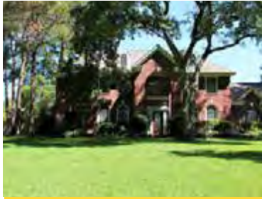
Lakes of Rosehill