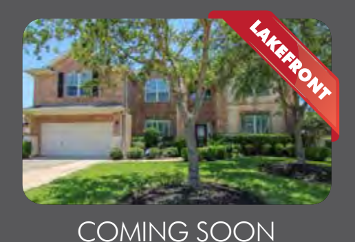
2301 BENDING SPRING DR. PENDING 4 DAYS ON THE MARKET 4 BED / 3.5 BATH / 2 CAR GARAGE

Shadow Creek Ranch - July 2015 Copyright © 2015 Peel, Inc.