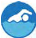
LEARN TO SWIM