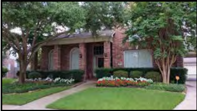
7502 ALLEGRO DRIVE