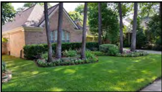
8014 ENSEMBLE DRIVE