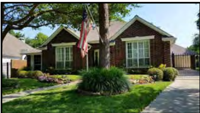
8814 ANDANTE DRIVE