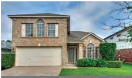
CHERRY CREEK $292,500 3 BR 2.5 BA