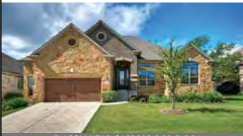
FALCON HEAD $459,900 3 BR 2.5 BA