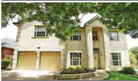
MERIDIAN $419,900 4 BR 3 BA