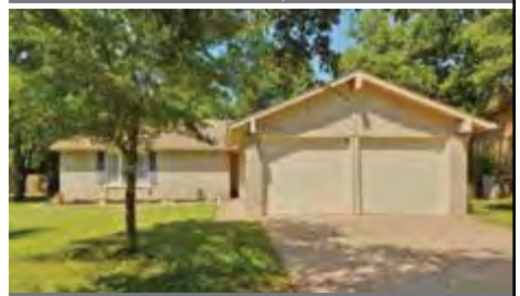
TRAVIS COUNTRY $375,000 3 BR 2 BA

MORE MONEY, IN LESS TIME, WITH THE FEWEST HASSLES AND FLEXIBLE COMMISSIONS – ONLY WITH ASHLEY