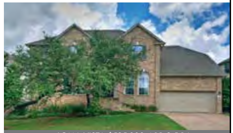
LOMA VISTA $525,000 4 BR 3.5 BA