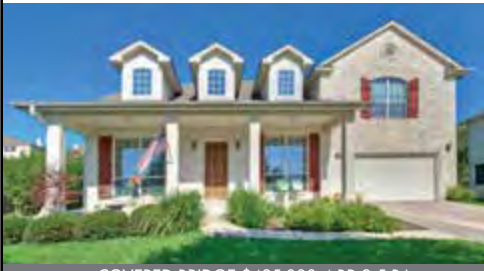
COVERED BRIDGE $435,000 4 BR 3.5 BA