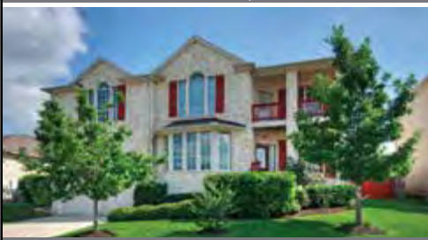
LANTANA $539,000 5 BR 3.5 BA