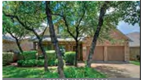
LACROSSE $412,000 4 BR 3 BA