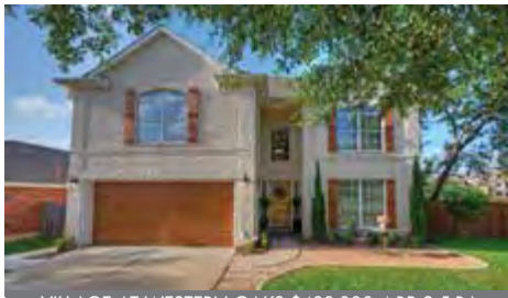
VILLAGE AT WESTERN OAKS $488,000 4 BR 2.5 BA