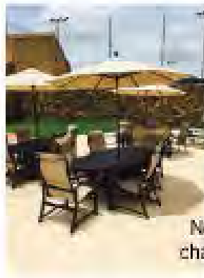
New tables & chairs for your enjoyment