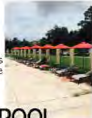
Relaxing loungers with shade