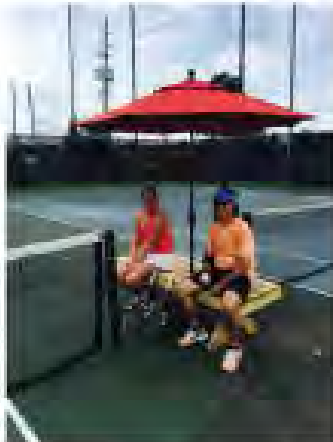
New benches w/umbrellas for shade at the tennis courts