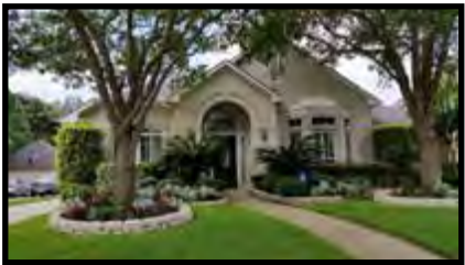
Section 3 Winner