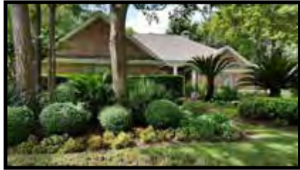
Section 2 Winner