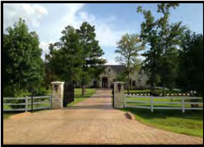
9044 Grand Lake Estates