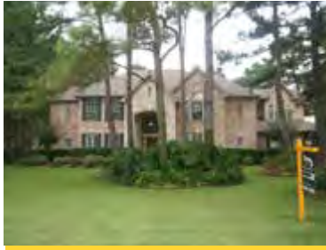
Lakes of Rosehill

Stunning 5 bdrm, pool, 3-car on 3/4+acre