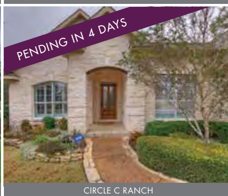
CIRCLE C RANCH