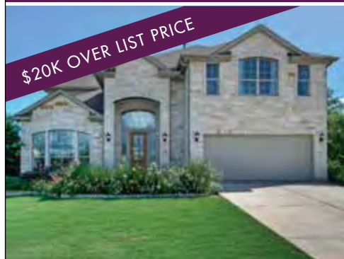
CIRCLE C RANCH