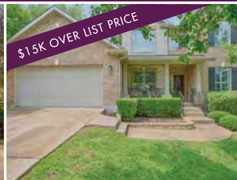
CIRCLE C RANCH