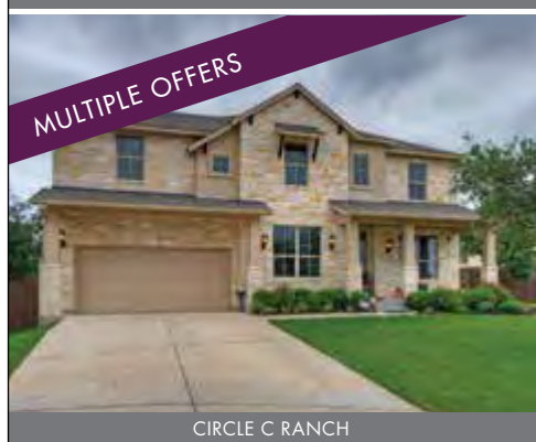
CIRCLE C RANCH