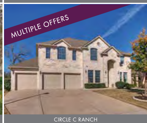
CIRCLE C RANCH

MORE MONEY IN LESS TIME WITH THE FEWEST HASSLES AND COMPETITIVE COMMISSIONS – ONLY WITH ASHLEY!