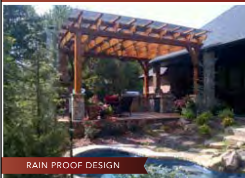
RAIN PROOF DESIGN

PATIO COVERS | PERGOLAS | CAR PORTS | PORTE COCHÈRES | DECORATIVE OUTDOOR FLOORING