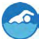
LEARN TO SWIM