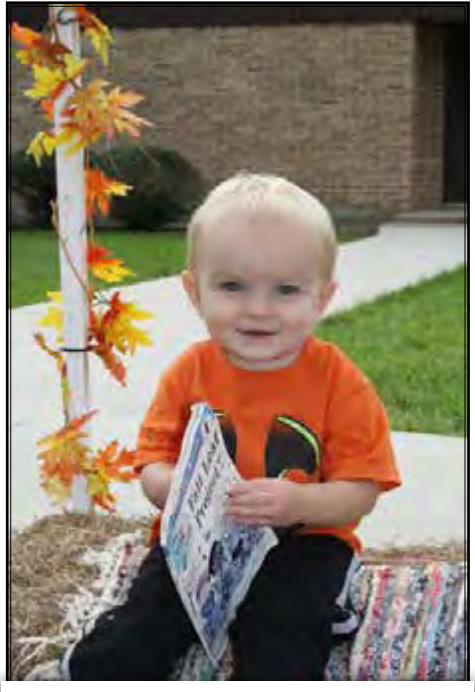
"Pumpkin Cole" Submitted by Cathy Covey