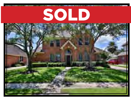
20823 Autumn Redwood Way