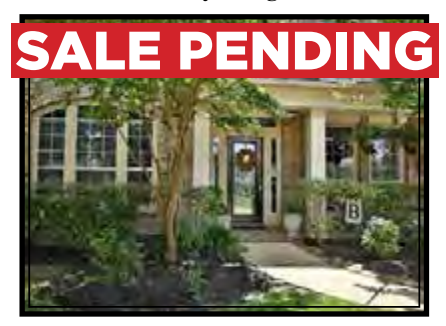
16819 N Swirling Cloud