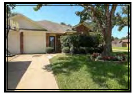
19835 Black Cherry Bend