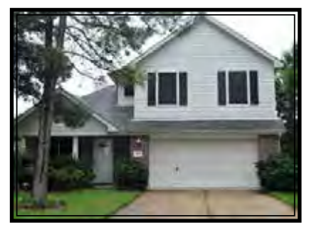
20335 Fairfield Park Way