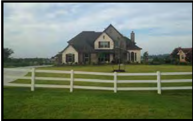
8870 Taylors Ct.