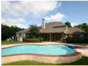
Lakes of Rosehill

Coveted Lakes of Rosehill for less than $5K