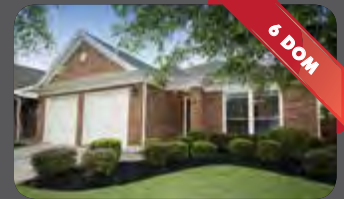
SOLD 13112 CASTLEWIND LN. 6 DAYS ON THE MARKET 4/2/2 1 STORY HOME