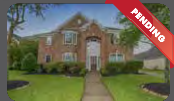
SOLD 2506 QUIET LAKE CT 4/3.5/2 $299,995