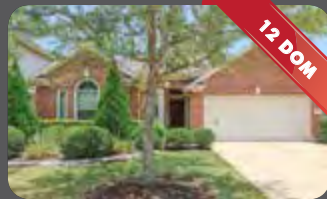
PENDING 2911 EMERALD BROOK LN 3 BED / 2 BATH / 2 CAR GARAGE $199,999