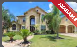
AVAILABLE 2225 LONG COVE COURT 5 BED / 3.5 BATH / 3 CAR GARAGE POOL / $599,900