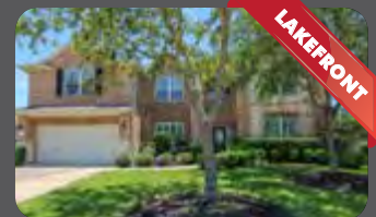
SOLD 2301 BENDING SPRING DR. 4 BED / 3.5 BATH / 2 CAR GARAGE