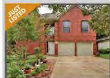
5800 LOMITA VERDE CIR 3 BD 2.5 BA 1932 SQ FT - $339,500

Call Today For A FREE Market Analysis Of Your Home! 512.461.1577