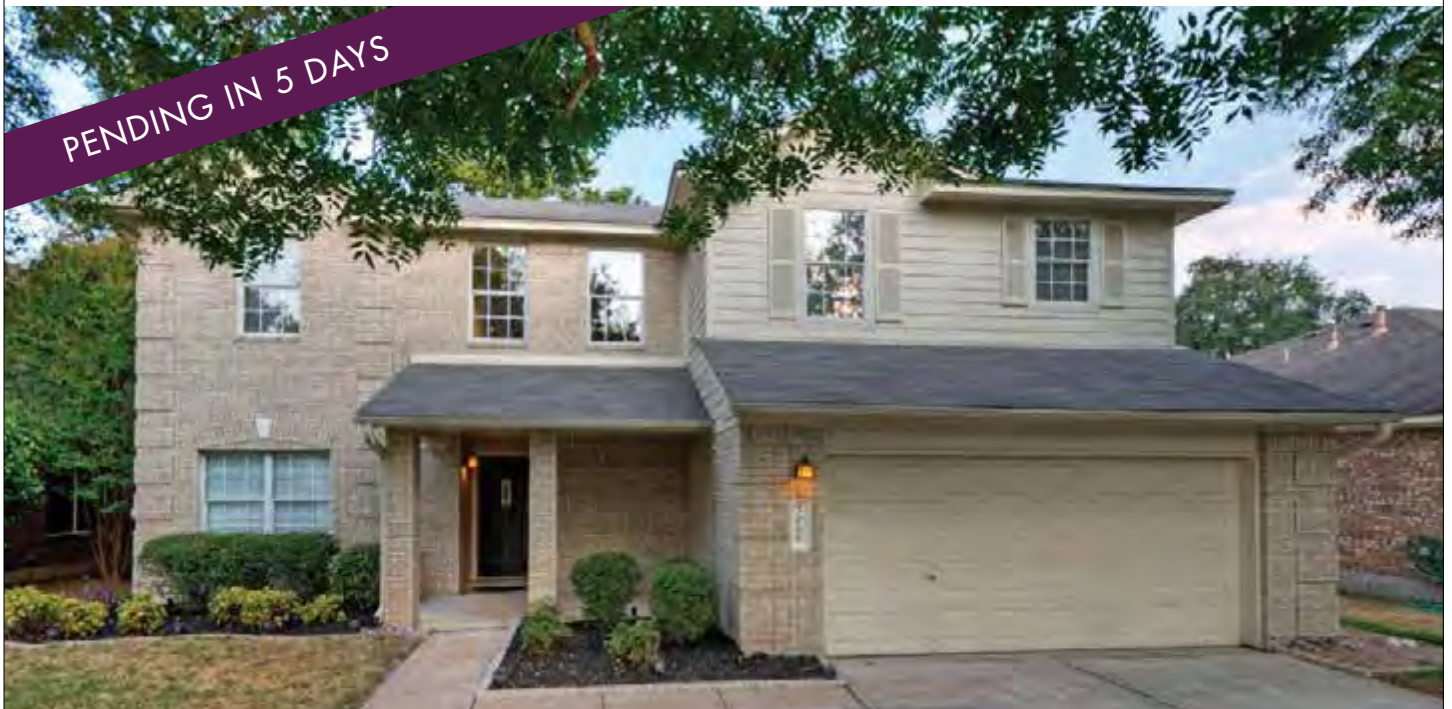
7009 WANDERING OAKS