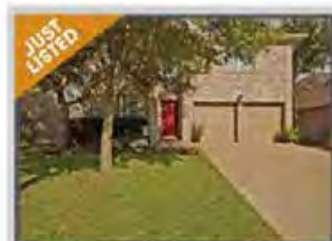
9104 WAMPTON WAY 3 BD 3 BA 2502 SQ FT - $365,000