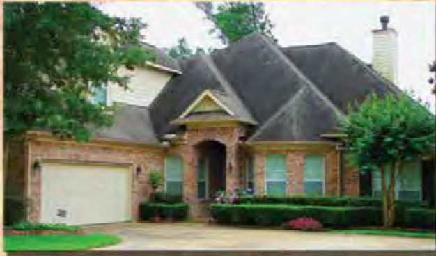
4785 JACKSON SQUARE DR