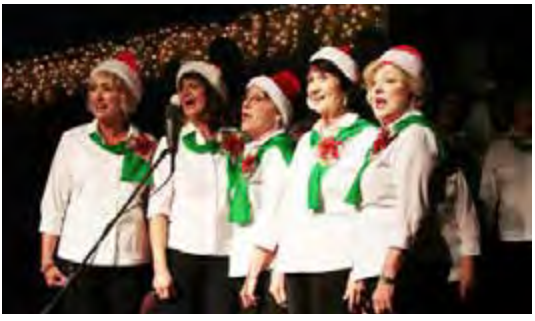
SingAlong Christmas Show – a Holiday extravaganza.