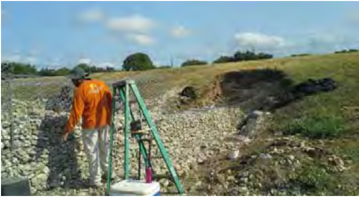
A look at the entire rock gabion wall that had to be replaced.

areas damaged by heavy equipment have been hydromulched with Bermuda grass. The process of re-vegetation may take a few months depending on the weather. The following photos show the scope of the project.