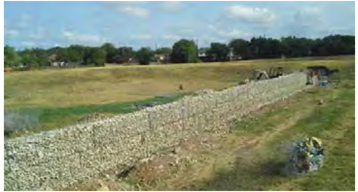
A close up of the final section of the rock gabion wall construction.

From design to print to mail, Quality Printing can help you with all of your printing needs!