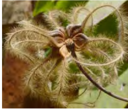
Scarlet Clematis seeds have long, feathery tails that aid in wind dispersal.

Wind helps seeds float or flutter away, often aided by seed structures such as thin wing extensions or long, feathery tails like those on the endemic Scarlet Clematis ( Clematis texensis ). Texas Bluebonnets ( Lupinus sp. ) employ the expulsion or explosion method, where the small, pebble-like seeds are forcibly expelled when the dried pods twist open in the warm sun. Gravity plays a part in many plants seed dispersals, where weighty seeds fall off the plant and roll to a new location. The best example of this are the round, heavy fruits that simply fall off a plant when ripe, such as those on Mexican Plum ( Prunus mexicana ) or Texas Persimmon ( Diospyros texana ). If the fruits have a tough outer shell, they may travel some distance from the parent plant, and if they have a soft skin, they