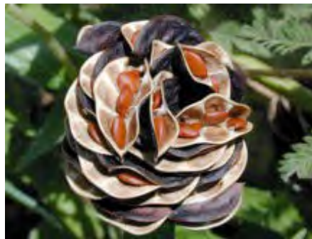
Illinois Bundleflower seeds are eaten and dispersed by ground birds such as quail.