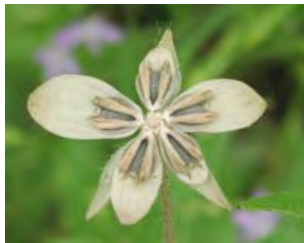
Texas Star is named after the five-petaled flower and star-shaped seed head left behind after it blooms.

may break open where they fall and scatter the seed or seeds within.