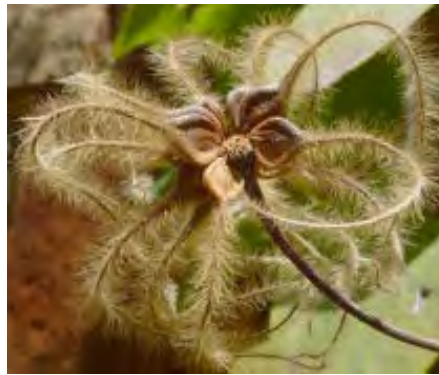
Scarlet Clematis seeds have long, feathery tails that aid in wind dispersal.

Wind helps seeds float or flutter away, often aided by seed structures such as thin wing extensions or long, feathery tails like those on the endemic Scarlet Clematis ( Clematis texensis ). Texas Bluebonnets ( Lupinus sp.) employ the expulsion or explosion method, where the small, pebble-like seeds are forcibly expelled when the dried pods twist open in the warm sun. Gravity plays a part in many plants seed dispersals, where weighty seeds fall off the plant and roll to a new location. The best example of this are the round, heavy fruits that simply fall off a plant when ripe, such as those on Mexican Plum ( Prunus mexicana ) or Texas Persimmon ( Diospyros texana ). If the fruits have a tough outer shell, they may travel some distance from the parent plant, and if they have a soft skin, they