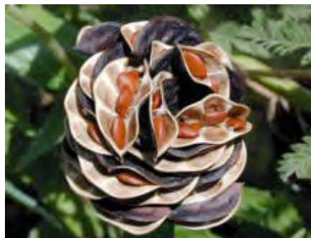
Illinois Bundleflower seeds are eaten and dispersed by ground birds such as quail.