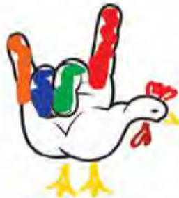
Rock On Turkey