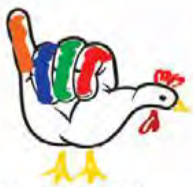
Love You, Man Turkey