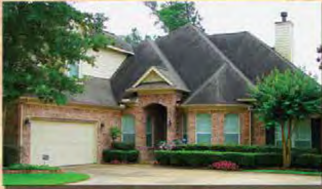
4785 JACKSON SQUARE DR