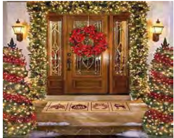
Holiday Decorating Contest

Show your holiday spirit by decorating your home and/or yards during the holiday season. The Park Lakes POA Board of Directors will choose a 1st, 2nd and 3rd prize winner from each section.